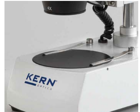
With black stage plate