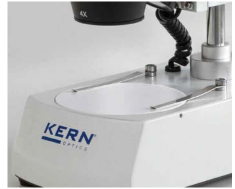
With white stage plate