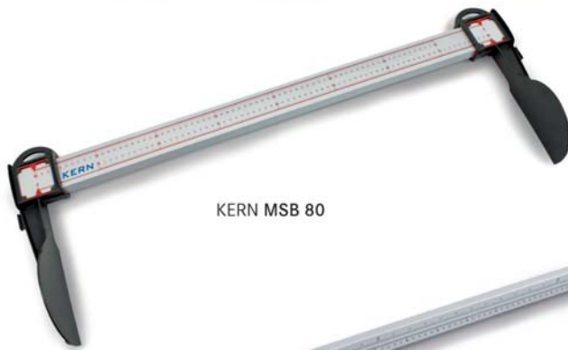
KERN MSB 80