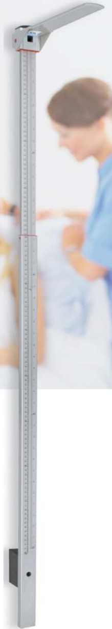
KERN MSF 200