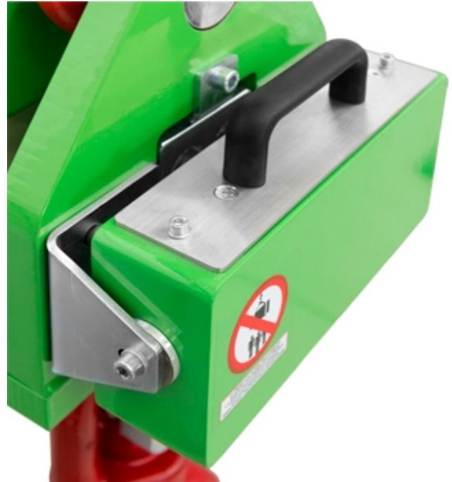
Fitted with extractable rechargeable battery pack.