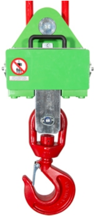
MCWHU: view of the back.