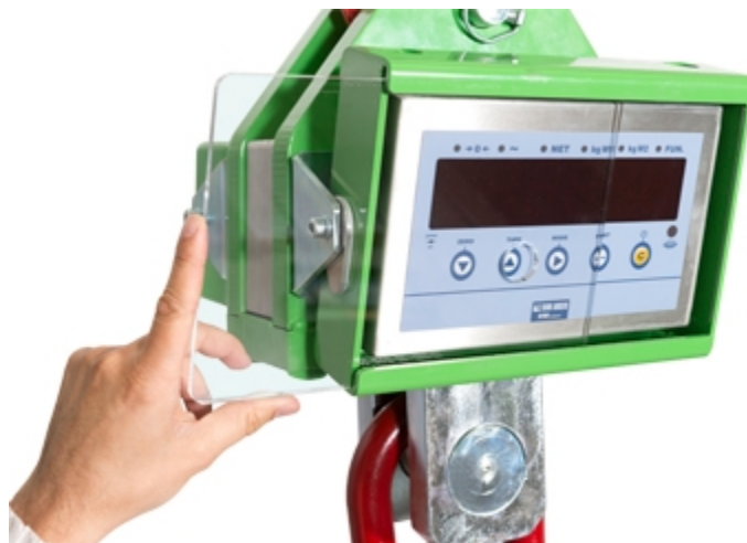
Protective screen in plexiglas for display and keyboard.