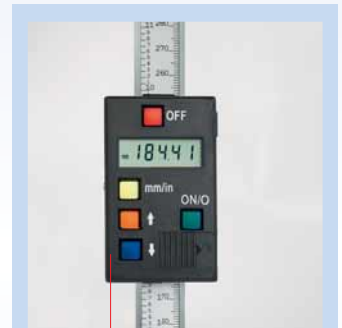
Setting of the pre length / zeroing