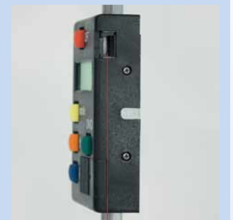
RS 232 PC Output